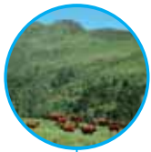
Auvergne volcanic mountains in Cantal

Populations on different sites from these 3 species are evaluated every year