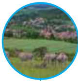
Dry calcareous grassland